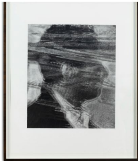
Los Angeles, Ohwow Leap Second May 18 - June 23, 2012